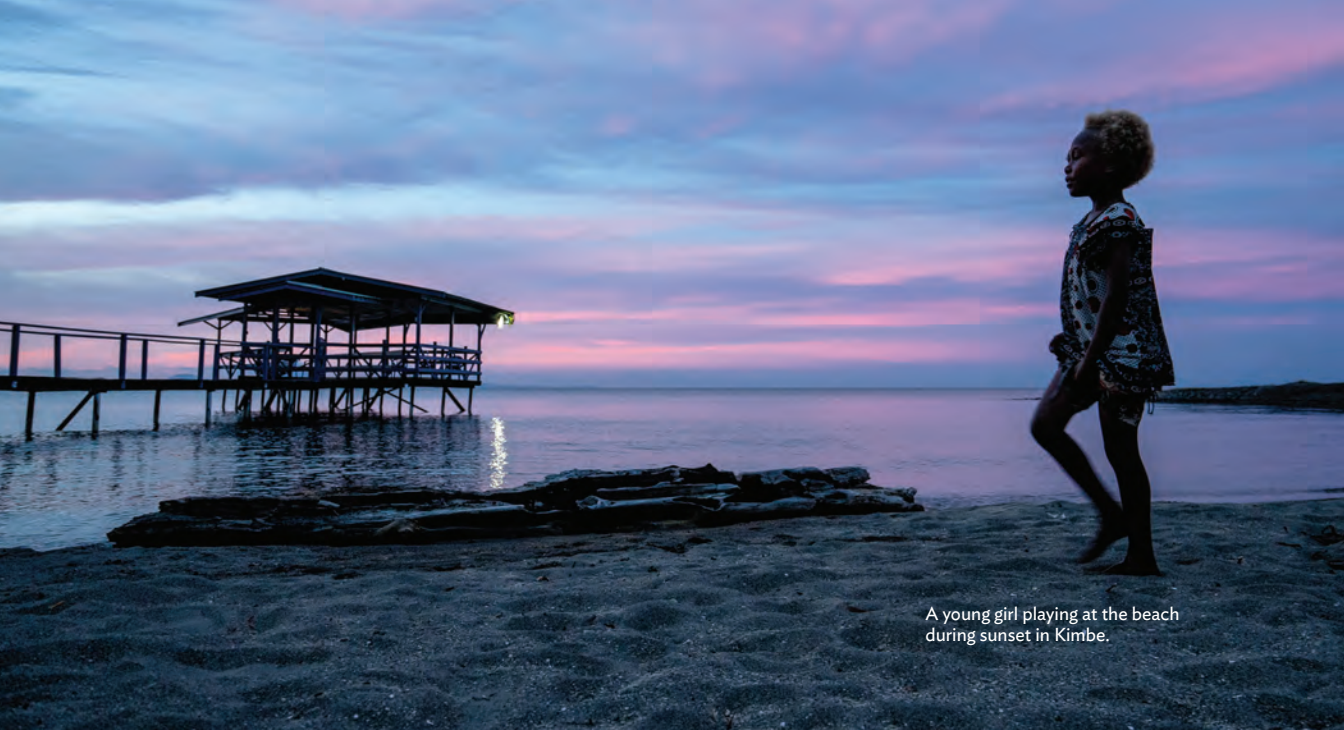
A young girl playing at the beach during sunset in Kimbe.

The Pacific Private Sector Development Initiative is also encouraging appropriate state participation in the economy by providing advice on PPP frameworks and transactions, including on projects to establish solar farms in provincial centers, and on options to meet Port Moresby's future water supply needs. The initiative is also supporting a pilot project that will help women enter the fisheries sector, and will demonstrate a scalable model for establishing sustainable businesses in the formal economy.