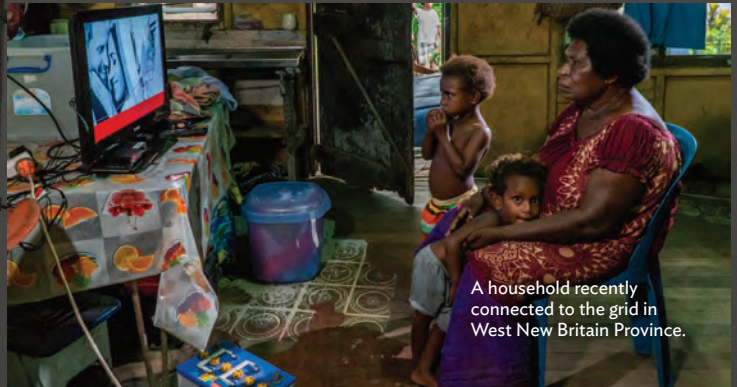
A household recently connected to the grid in West New Britain Province.

Access to electricity can help create economic opportunities and support better education and health outcomes. However, only 12% of PNG's population is connected to the electricity grid, and the country's outdated transmission and distribution lines lead to frequent outages in urban centers. Scaling up renewable generation capacity and improving grid efficiency can increase access to power, reduce the cost of electricity, and help mitigate greenhouse gas emissions.