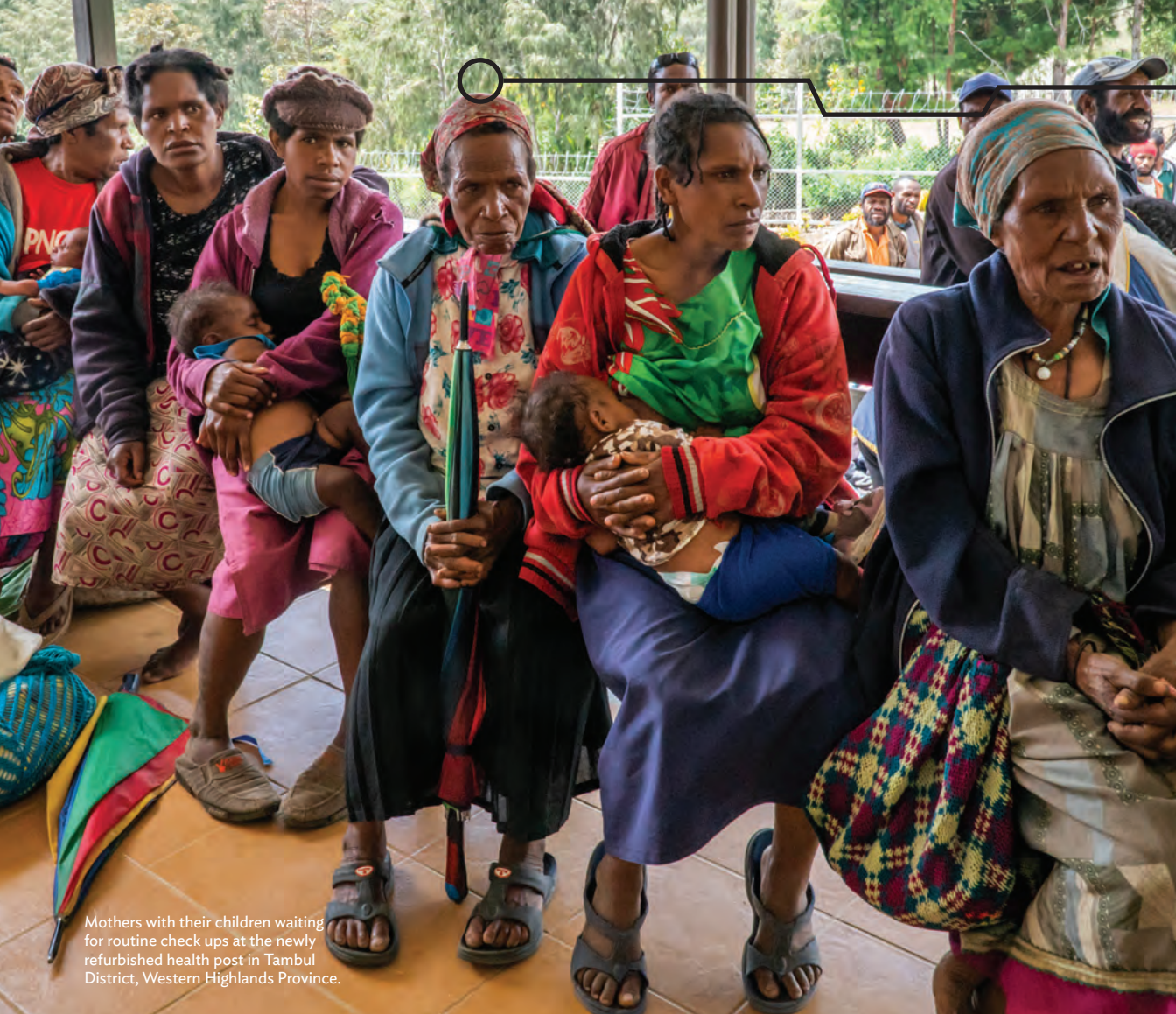
Mothers with their children waiting for routine check ups at the newly refurbished health post in Tambul District, Western Highlands Province.